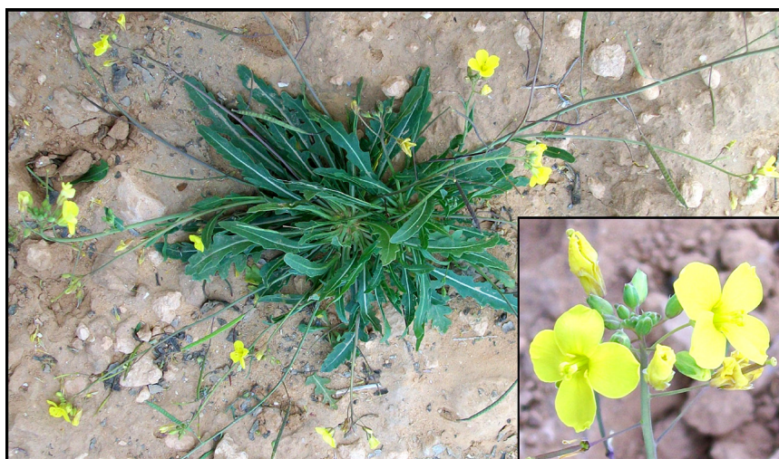
Fig. 1. Diplotaxis simplex Spreng., Brassicaceae, collected from south-eastern Tunisia (Medenine: Boughrara area at 19 m altitude, latitude 33° 30'91" N, longitude 10° 38'26" E).

with varying concentrations from 1.25 to 5 mg/ml. The results were expressed as percentage inhibition using the following formula: