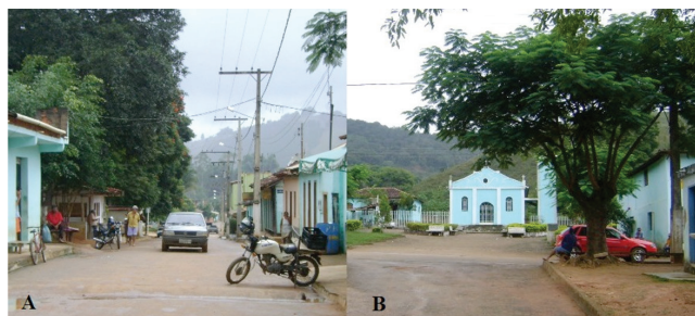
Figure 1 - The central region of São José da Figueira (A) and the Catholic Church (B).

organization is based on family farming and the main crop is coffee. Men are responsible for agricultural activities on their own properties, and during coffee harvest and process they also provide temporary services to other producers. Women are housewives and occasional farmworkers, and are responsible for the care of the family, which includes cultivating the main species used for subsistence and food preparation. They tend to their homes, children and gardens.