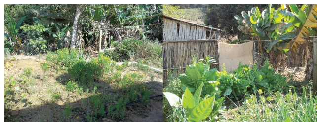
Figure 2 - Two of the home gardens of the rural properties visited.

Almost all the residences in this rural community have home gardens, most of these are located close to the family home and provide food for the daily meals (Fig. 2). Combined with the cultivation of vegetables, medicinal species help constitute the biodiversity of the home garden, mainly those plants used for primary family health care are selected. All the women interviewed stated that they were responsible for tending the home garden. As in other studies, in São José da Figueira the women are of significant importance in managing the home garden, deciding which species will be cultivated and selecting especially plants with a medicinal uses (Camou-Guerreiro et al., 2008; Galluzzi et al., 2010; Castro et al., 2011). The collection and exchange of seeds and seedlings between neighbors is a common practice, which is of special importance for the preservation of knowledge, contributing to the transmission of information about cultivation, use and preparation methods, and preservation of the diversity of these species (Ban and Coomes, 2004; Oakley, 2004;