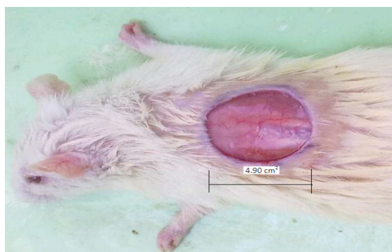
Figure 1. Excision model in mice (arrow mark show excision wound in mice).

Group V: AESR of 500 mg/kg b.w. (topically)