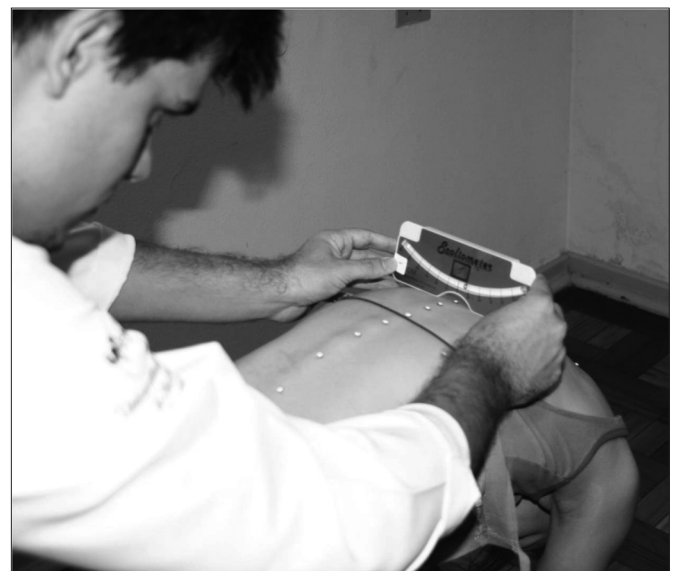
Figure 2. Evaluation performed with the scoliometer with the participant standing in trunk flexion.

Measures of axial rotation performed on the 17 spinous processes (T1 to L5) were analyzed in categories according to four vertebral levels: upper thorax (T1 to T4), medium thorax (T5 to T8), lower thorax (T9 to T12) and lumbar (L1 to L5).