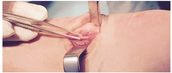
Figure 2. A thickened plantaris tendon located close to the thickened Achilles tendon mid-portion in a patient with chronic painful mid-portion Achilles tendinopathy+plantaris tendon involvement.

Recently, focus has been placed on the plantaris tendon, located in close relation to the medial Achilles. There seems to be a subgroup of patients suffering from chronic painful mid-portion Achilles tendinopathy, where a thickened plantaris tendon is involved 16 . These patients have both mid-portion Achilles tendinopathy with high blood flow on the ventral side of the tendon and a closely located plantaris tendon (demonstrated with ultrasound) with also a localized high blood flow (Doppler) on the medial side of the Achilles. These patients most often complain of having pain located on the medial side of the Achilles, where the medial soleus inserts. It is our observation that if the plantaris tendon is involved there is often a poor response to eccentric training. This can theoretically