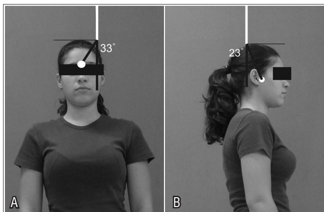
A. Sway angles (°) in the frontal (right-left) plane measured with Corel Draw; B. Sway angles (°) in the sagittal (anterior-posterior) plane measured with Corel Draw.

To analyze the effect of sight, we proposed the calculation of the difference between each child's number of sways with and without eyes covered.