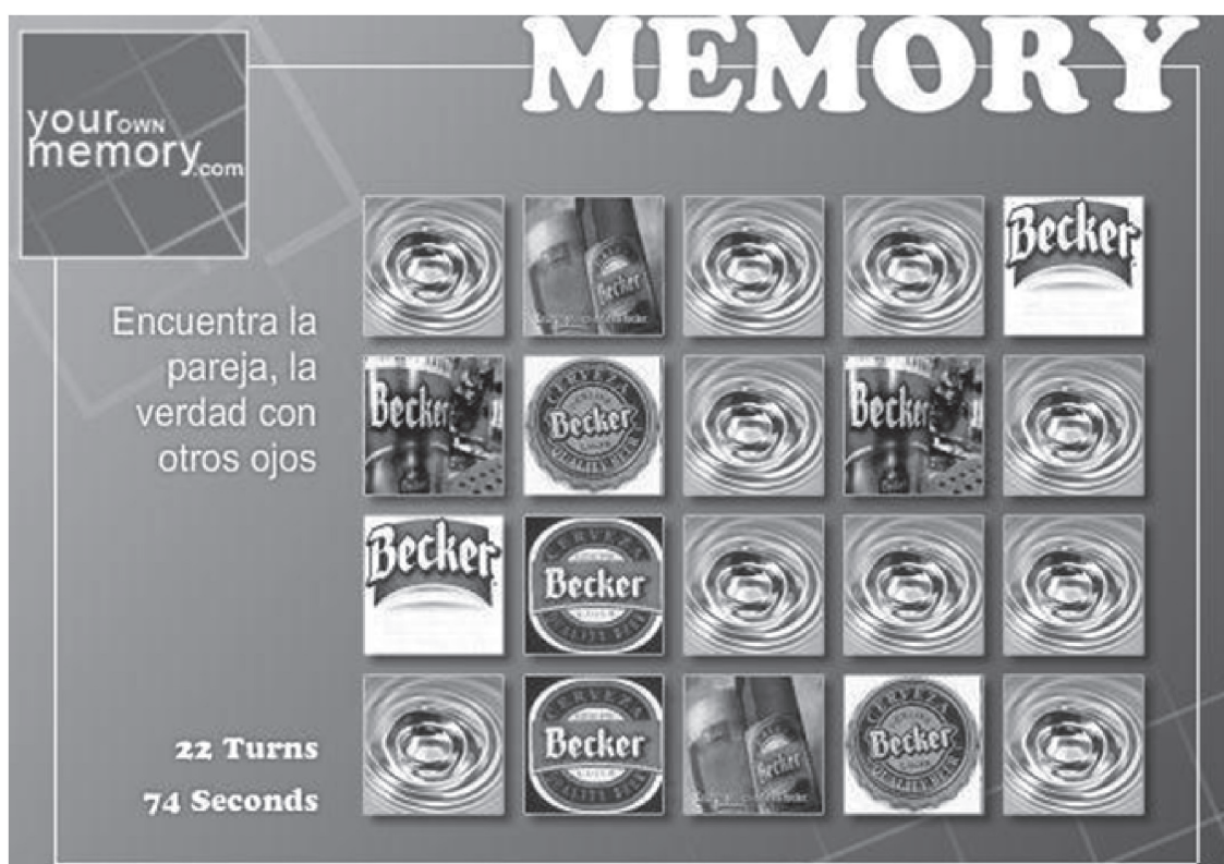
Figure 2. Advergame used in this experiment.