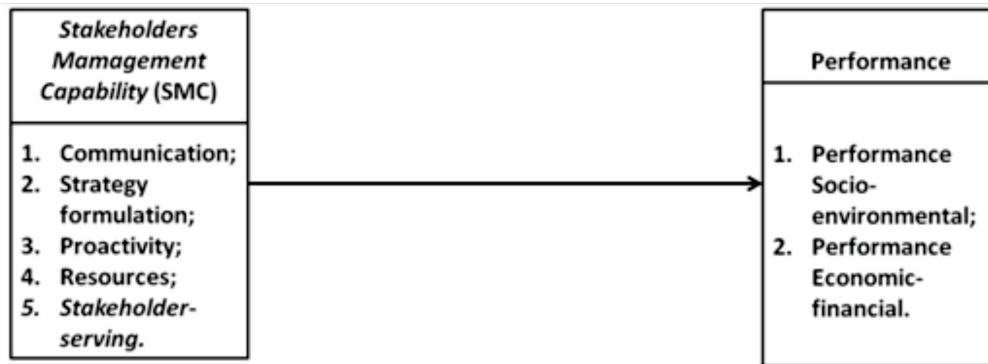
FIGURE 1– Relationship diagram of the research constructs.

These hypotheses are illustrated in Figure 1.