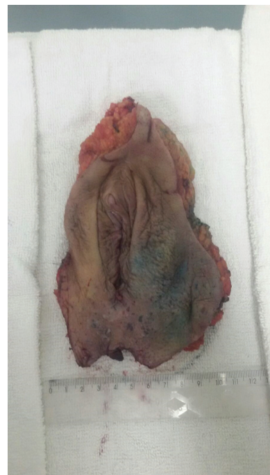
Fig. 5 Surgical specimen.

Other than what is usually described, the patient's lesion was not eczematous and was very difficult to notice without