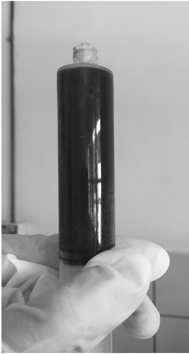
Fig. 2 Thick, hemorrhagic ascitic fluid sample.

The ascites was of acute onset in 8 women, and gradual in 24 patients (► Supplementary Material 1 ). The type of onset was not reported in six cases.