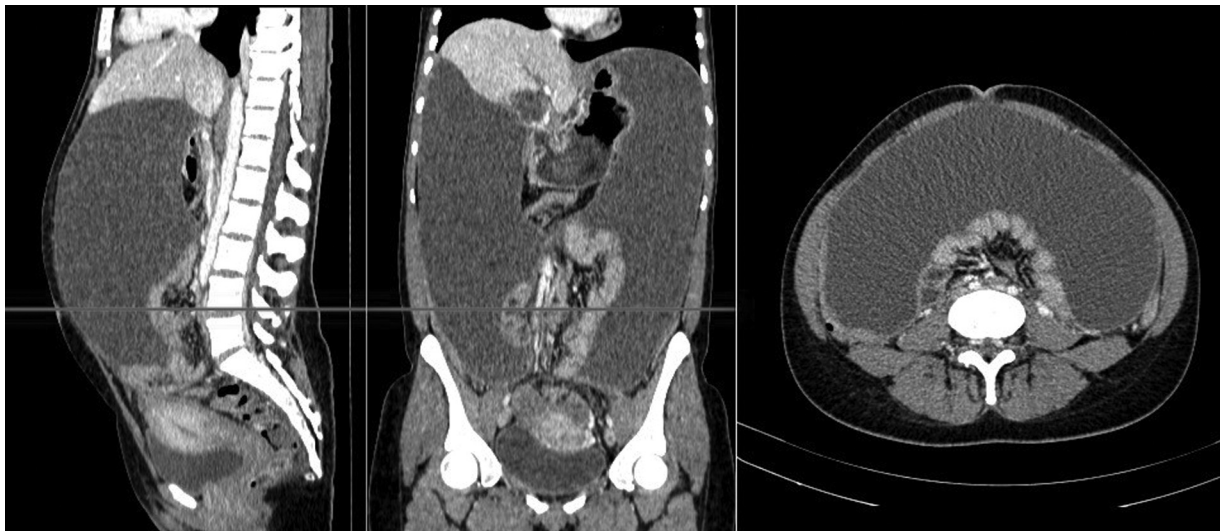
Fig. 3 Contrasted computed tomography (CT) showing massive ascites, centrally encased bowels, and thickened peritoneum.

The treatment choices for the patients included in this review involved hormonal therapies, surgery, anti-inflammatory drugs (steroidal or non-steroidal) or a combination of