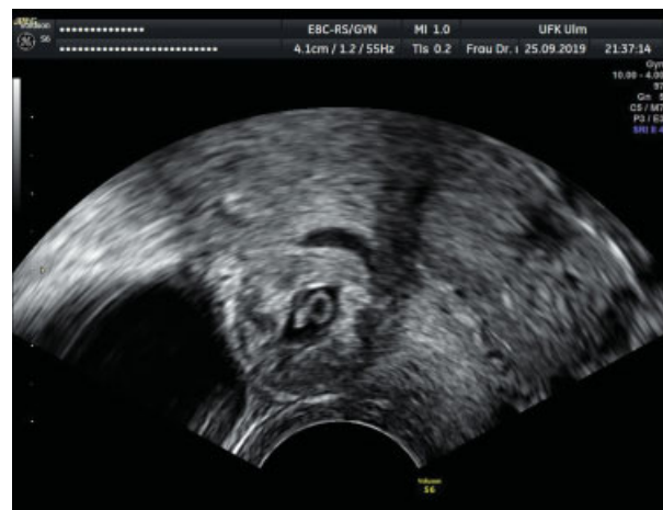
Fig. 1 Ultrasound picture of a scar pregnancy.

A total of nine patients were initially treated with methotrexate (MTX). Three patients received the application intramuscularly (IM) (Cases 1, 2, and 8), and in 1 case