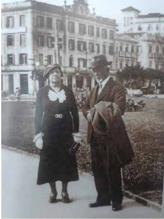
Figure 1 – Teodoro Sampaio and Capitolina, n.d.