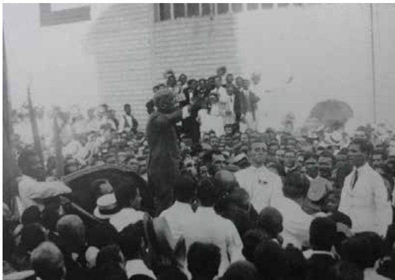
Figure 3 – Rui Barbosa giving a speech in the port in Salvador.

him, a group of men from the local commerce organized a Guarda Branca (white guard) who used straw hats and white suits with a badge on the lapel with an image of Rui Barbosa. They had the task of policing the “the masses of people” that jostled in the port as can be seen in Figure 3.