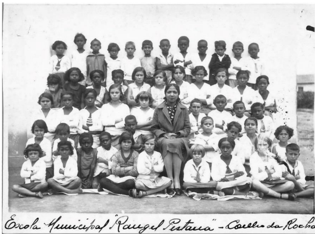
Photograph 3 - Rangel Pestana Municipal School.