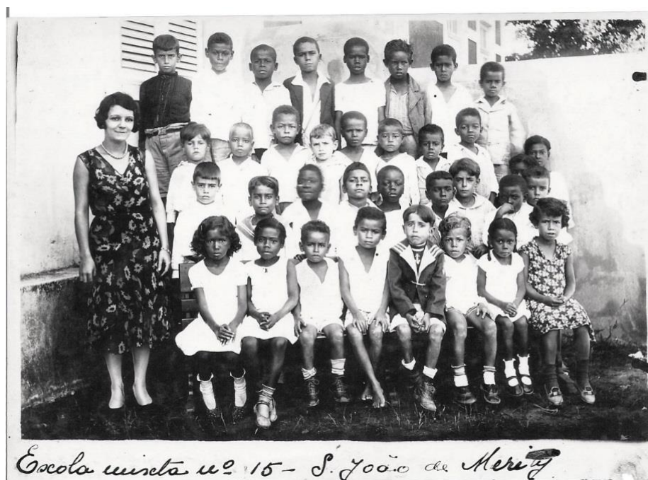
Photograph 6 - State School no. 15.

The mentioned lack of proportion between the number of enrolled students in the freshmen year and that in the sophomore and junior years highlights the elementary school type experienced at those decades in São João de Meriti. There were isolated schools, with three teaching grades, and with the concentration and permanence of students' applications in the freshmen year. We have inferred that Photographs 6, 7 and 8 regard the most advanced classes at co-educational high school no. 15: