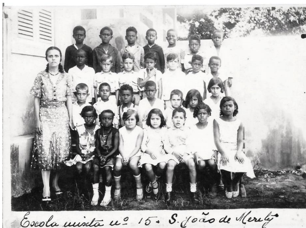
Photograph 7 - State School no. 15.