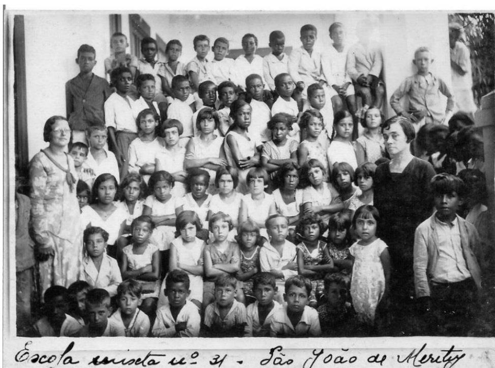
Photograph 11 – State School no. 31.