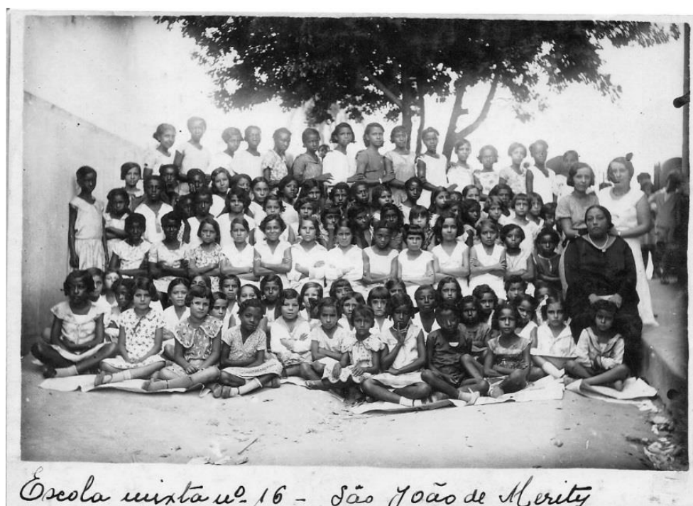
Photograph 12 – State School no. 16.

The analysis of attendance maps either in School # 15 or in School # 31 showed the largest number of boys' applications. But the documentation of School # 16 (APERJ, FDE, 02741) stops the possibility of interpreting that girls were less frequent at school (Photograph 12). Assumingly, families would prefer to enroll girls in girls' schools.