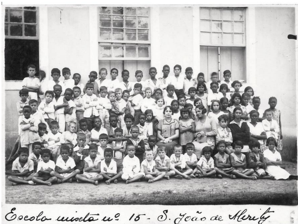
Photograph 5 – State School no. 15.