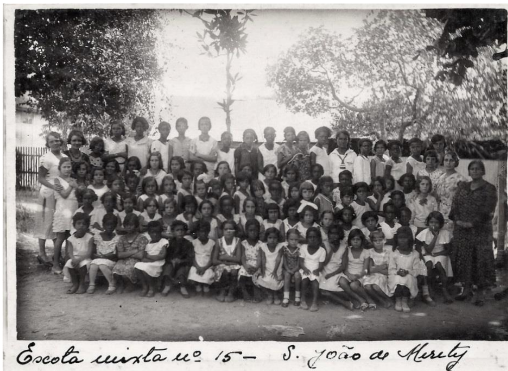
Photograph 4 – State Schhol no. 15.