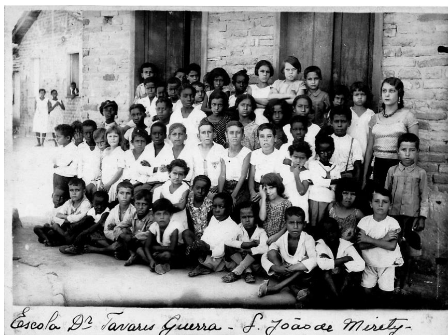
Photograph 1 - Tavares Guerra Municipal School.