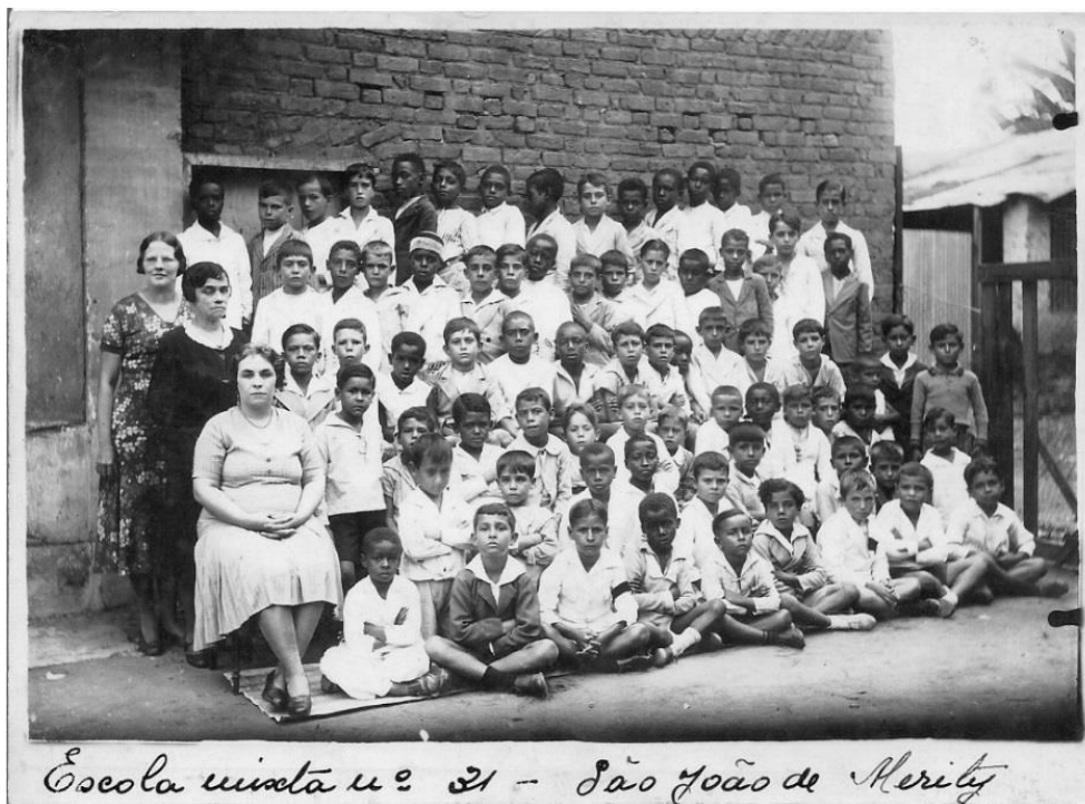
Photograph 10 – State School no. 31.