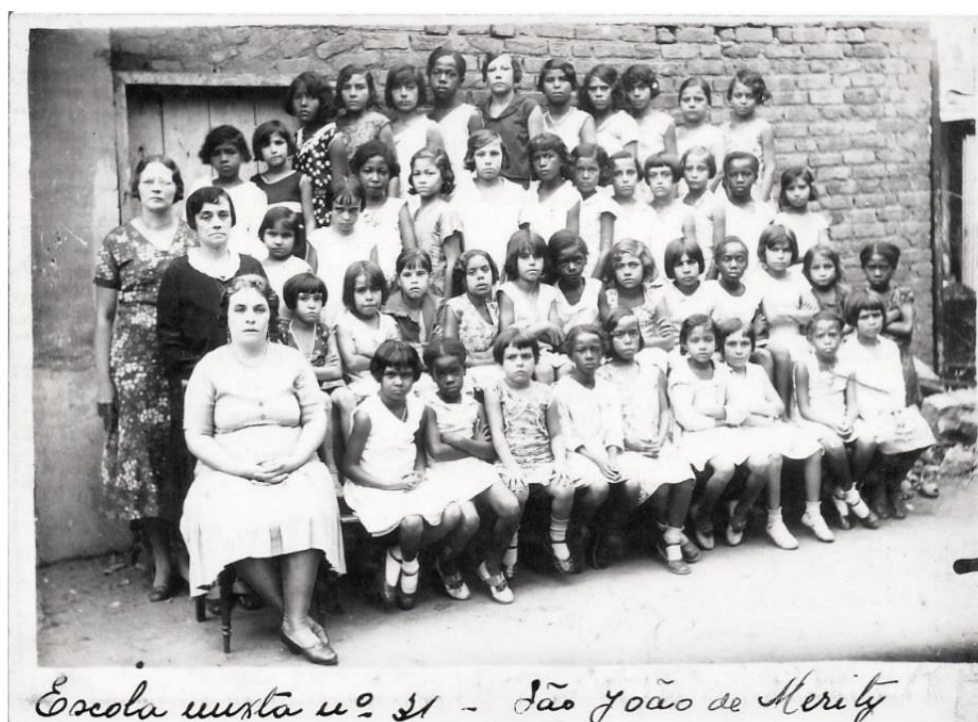
Photograph 8 – State School no. 31.

Besides the teachers' likely interest in the allocation to São João de Meriti, it is relevant observing that, although there were girls' and boys' state and municipal schools in São Joao de Meriti, there was demand for new students' applications. In 1932, girls and boys were photographed in separate, although state school # 31 was of the co-educational type; a third image shows boys and girls in the same photo, as it can be seen in Photographs 9, 10 and 11.