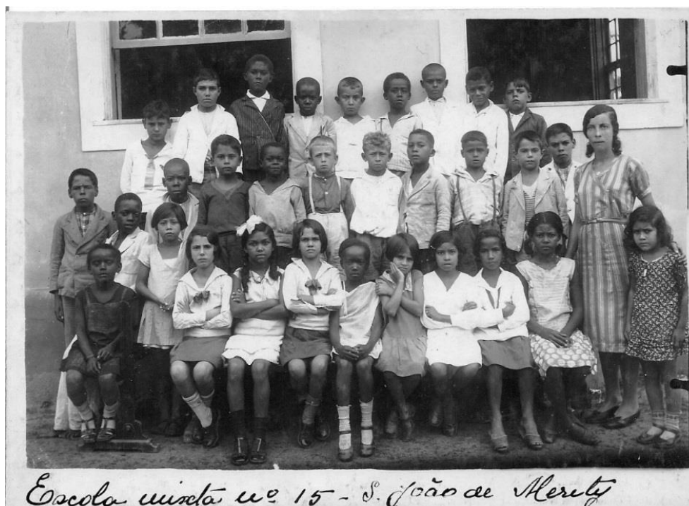
Photograph 6 - State School no. 15.