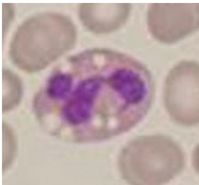
Figure 1. Large cytoplasmic lipid vacuoles in neutrophils suggesting Chanarin-Dorfman syndrome. Peripheral blood, stained with Leishman's stain: magnified 1000 x