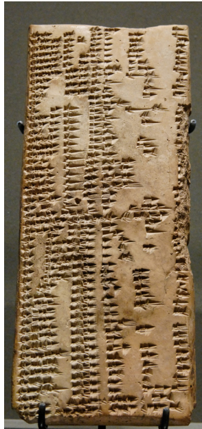
FIGURE 1 – Tablet 16 of the Urra=hubullu , Sumerian-Akkadian bilingual vocabulary 2

After this period, it is also very interesting to note that the Babylonian Akkadian had developed over the centuries, collaborating to the formulation of the diplomatic language of the Canaanite scribes around the middle of the 14 th century BC. During this century, many letters were sent to the Egyptian pharaohs by the rulers of Canaanite city-states. Today, researchers recognize that it possesses an elaborate linguistic system of its own. Shlomo Izre'el (2007) affirms that this is an example of institutionalized interlanguage, i.e. “a system of rules said to develop, in the mind of someone learning a foreign language, which is intermediate between that of their native language and that of the one being learned” (MATTHEWS, 1997, p. 182 apud IZRE'EL, 2007, p. 6) within a specific group, revealing