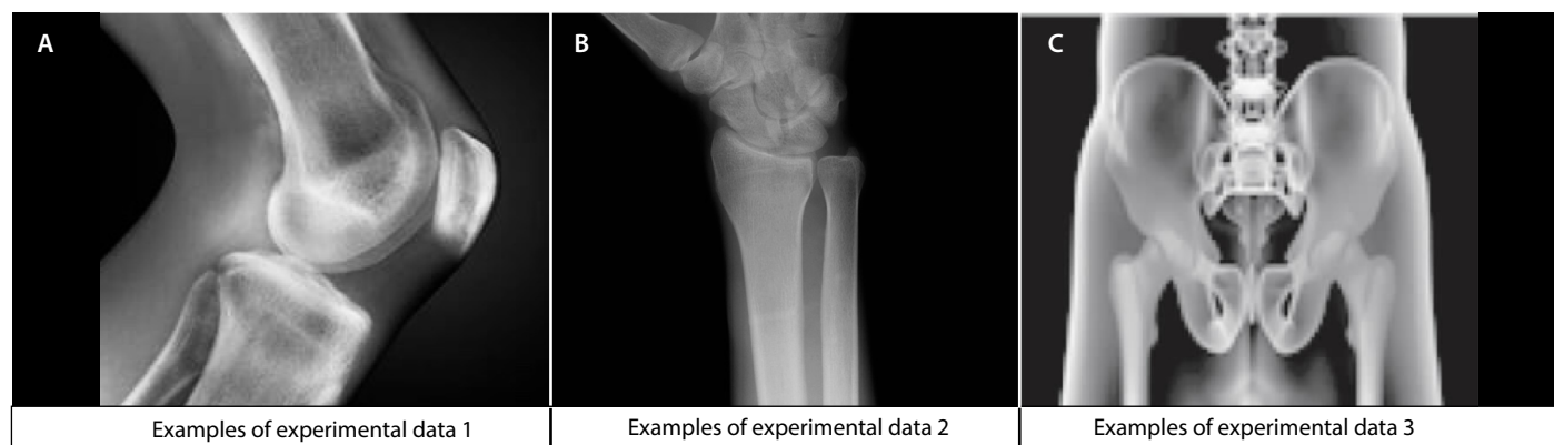
Figure 1. Examples of some experimental data.