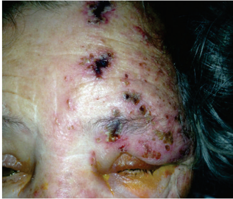
Figure 2: Acute onset of HZO in the left eye. Erythema, macules, papules, vesicles and crusts are shown. Eyelid swelling is pronounced.

The majority of the individuals had eyelid skin lesions (16 patients – 84.2%). Seven (36.8%) presented swelling, five (26.3%) showed skin hyperemia, five (26.3%) had active vesicles and nine (47.4%) exhibited crusts. Most of the presentations coexisted among patients as shown in figure 2. An early stage with erythema, macules, papules and vesicles can be seen in figure 3.