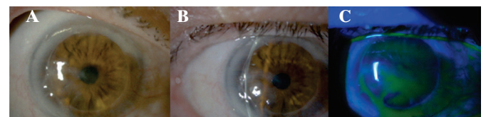
Figure 3: (A and B) Neurotrophic and exposure corneal ulcer after RGTA (Cacicol®, Thea) treatment. Complete epithelium healing, above a thin stromal layer. (C) Although a pooling of fluorescein is seen, corneal staining is not observed.

In the following weeks, an intensive facial physiotherapeutic program was undertaken, and the palpebral function progressively recovered.