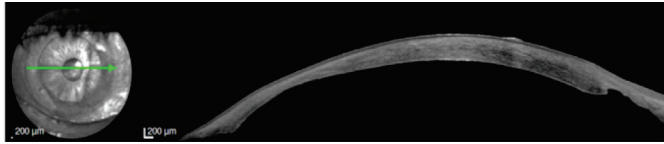
Figure 4: OCT showing a complete epithelial layer over the stromal thinning area.

In the control optical coherence tomography (OCT, Figure 4), after 9 months, corneal epithelial layer is complete and a small stromal thickness increase is observed.