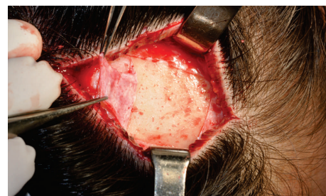
Figure 1: Incision in the midline of the parietal region

The main complications presented by the donor region are local pain, swelling, scarring that are sometimes visible, chance of local sensitivity alteration by nerve injury, and potential risk of local infection. (5)