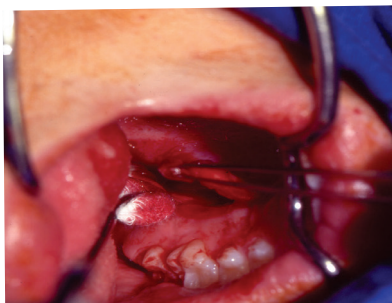
Figure 3: Collection of mucoperiosteal graft of hard palate