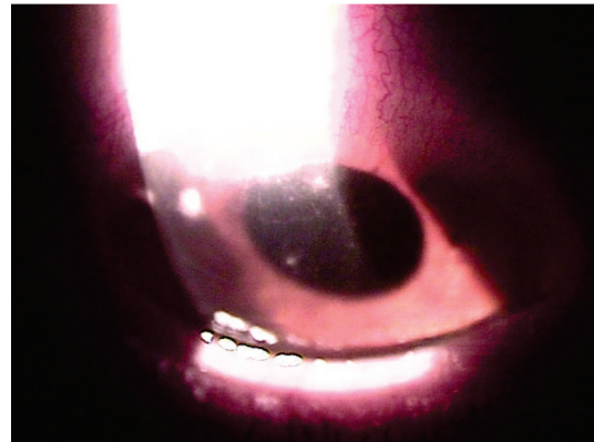
Figure 1: Improvement with topical steroids; initial keratitis possibly from canula seeding

The infection was controlled by antifungal agents and loss of the eye was avoided by total corneal transplantation associated with Gunderson conjunctiva cover (8) (Figure 3).