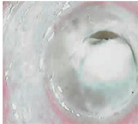
Figure 2: Total corneal melting with spontaneous eye perforation