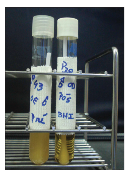
Figure 1: Preoperative (cloudy) and postoperative (clear) culture tubes

For culture, sterile normal saline, sterile swabs, and a sterile tube containing brain-heart infusion (BHI) medium were used (Figure 1). A blood agar plate was used for cultivating the bacteria. The sample material was rolled on a Petri dish with solid culture medium and was then spread onto the plate in parallel