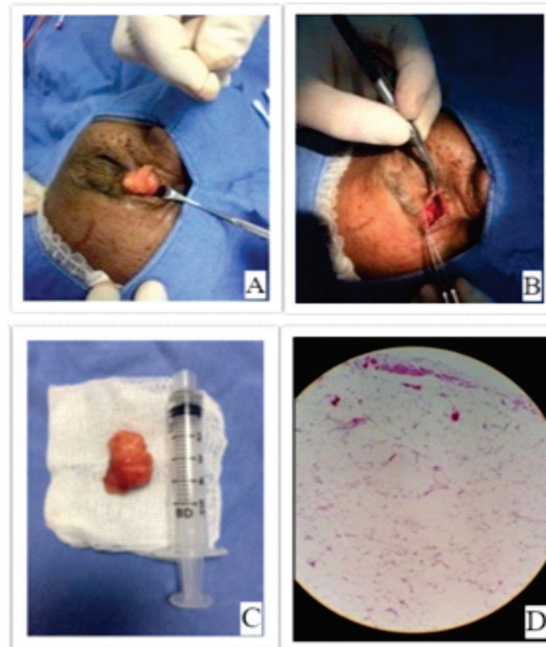
Figure 2: (A) intraoperative excision of the tumor; (B) view after tumor excision; (C) material sent for biopsy material; (D) tumor biopsy section for anatomopathological analysis, consistent with lipoma, without signs of malignancy.

The treatment chosen for this case was surgical, with excision of the tumor (Figures 2A, B and C) and an anatomopathological study.