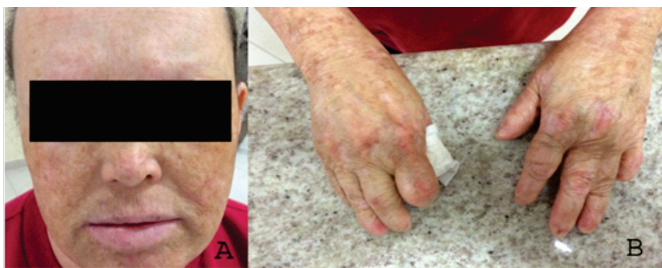
Figure 1 (A e B): Dry and scaly skin, alopecia, poikiloderma, hypoplasia of the fingers

The patient reported that since childhood has suffered from growth retardation and dermatological symptoms, with dry and scaly skin, followed by photosensitivity and erythema poikiloderma, particularly in the face, neck and limbs (Figures 1A and 1B)