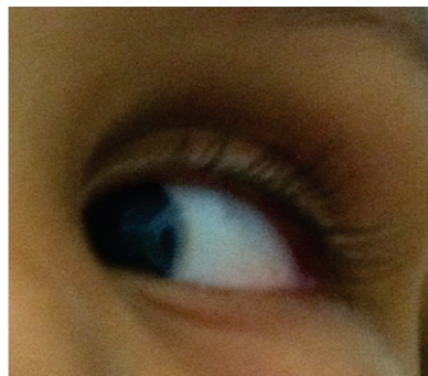
Figure 1: LE during initial inspection, showing constant isotropy, horizontal nystagmus, leukocoria and microphthalmia

passage of previously degenerated materials from the vitreous or the crystalline to the anterior chamber through the pupil hole.