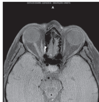
Figure 4: Nuclear magnetic resonance