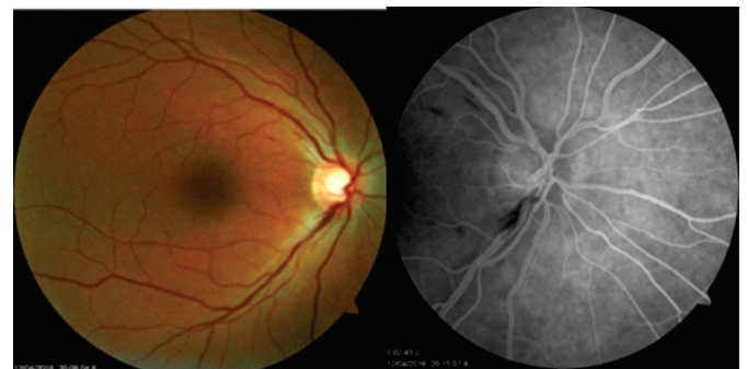
Figure 2: Angiography 04/12/2016