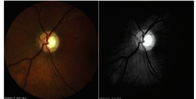
Figure 3: Red Retinography and Red Free 05/25/2016