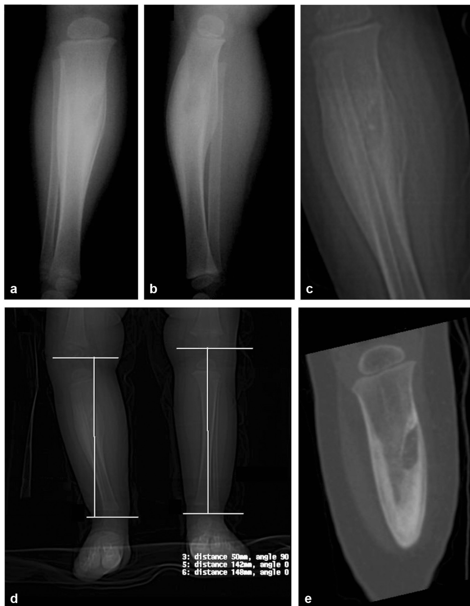
Fig. 1 Osteolytic lesion with sclerosis and calcifications in the right tibia; a, roentgenogram AP; b, profile, c, magnification; d, scanometry; e, coronal oblique reformation.

In another service, he had been submitted to roentgenogram of the right leg, with the visualization of a lesion in the right tibial proximal third. He had received a diagnosis of fracture. He had received a prescription of physical therapy that was performed for two months (12 and 13 months old) without any improvement.