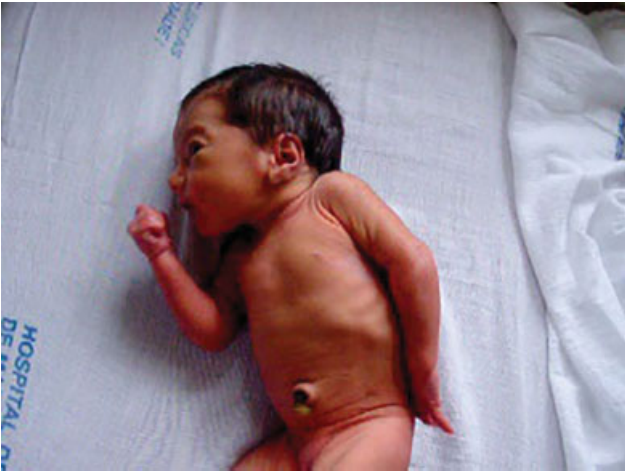
Fig. 2 Erb's obstetric paralysis.

roots; and low palsy, or Klumpke (C8-T1), in which the forearm and hand muscles are the most affected. The severity of the injury depends on the affected roots and its extent.