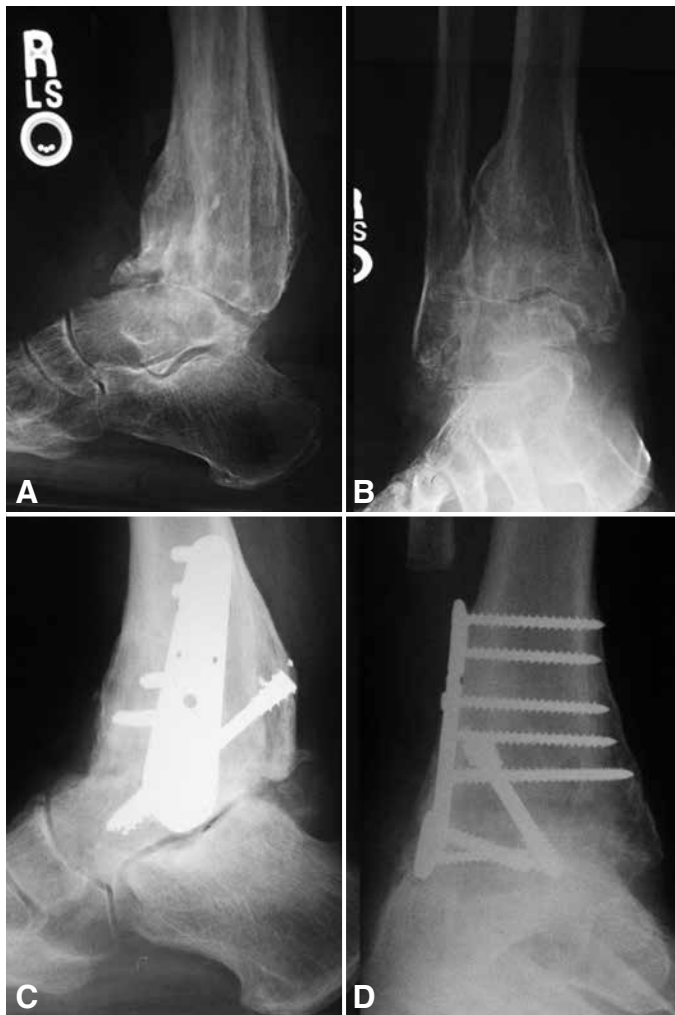
Figure 3 - 61 year old male patient presented with post-traumatic tibio-talar arthritis with pain and deformity. (A) The preoperative radiographs considerable deformity including anterior translation of the talus relative to the tibia and (B) varus deformity in the coronal plane. (C) Lateral and (D) AP weightbearing radiographs taken at 18 months follow up after corrective arthrodesis and successful fusion.

Sagittal plane alignment varied from 15 degrees of dorsiflexion to 12 degrees of plantarflexion radiographically with a mean of 1.6 degrees of dorsiflexion. Clinically, sagittal alignment varied from 10 degrees of dorsiflexion to 8 degrees of plantarflexion with a mean of 1.4 degrees of dorsiflexion. Coronal plane alignment