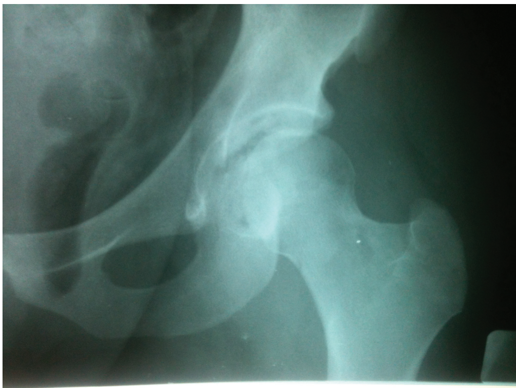
Fig. 1 Preoperative X ray of the left hip in anteroposterior (AP) view of a patient with posterior-wall small osteochondral avulsion after reduction of the hip dislocation.