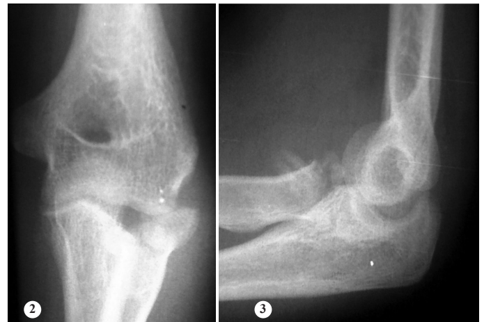
Figures 2 and 3 – Radiographs demonstrating fractures of the head of the radius and coronoid, and subluxated elbow, after reduction of a terrible triad of the elbow.

were treated using a metal prosthesis for the head of the radius in 10 patients (Figures 2, 3, 4 and 5). In another seven patients, open reduction and internal fixation was performed (screw with or without a plate). For the remaining two patients, the fractured fragment was resected. In treating the coronoid process, nine patients were treated without fixation of the fragment, and the other nine patients underwent suturing alone or in association with another fixation method (anchor or screw). In one patient, a plate was placed on the ulna because of the extent of the fracture (Box 2). In the final radiographic evaluation, we found that ten patients had evolved with calcifications surrounding the elbow. Clinically, the patients were evaluated using the final range of motion (flexion/extension and pronation/supination) and MEPS (Box 3). The final flexion/extension was 112^\circ \pm 28^\circ , the mean contracture in flexion was 24.3^\circ \pm 20^\circ and the mean flexion