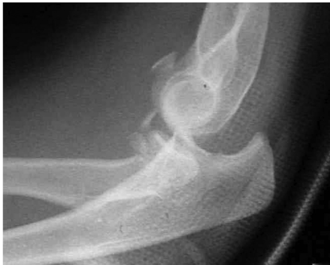
Figure 1 – Lateral-view radiograph of elbow, demonstrating “terrible triad”.

After investigating in the nosology sector of the teaching hospital (Hospital de Clínicas) of the Federal University of Uberlândia, MG, we found records relating to 35 skeletally mature patients with a diagnosis of elbow dislocation in association with fracturing of the coronoid process and head of the radius (Figure 1). These patients underwent surgical treatment between January 1999 and January 2008, with as minimum postoperative follow-up of two years. Out of this total, 14 patients could not be located to make a new clinical assessment, one patient had died and one patient was excluded from the group because the presentation was elbow dislocation plus Monteggia fracture. In this manner, 19 patients remained in the group.