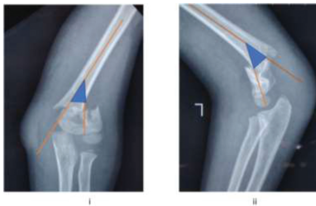
Fig. 1 (i, ii). Depiction of angulation in the coronal (i) and sagittal planes (ii) by lines along the mid diaphysis of the proximal fragment and a line perpendicular to the elbow joint in the distal fragment.

Age, gender, laterality, mode of injury, injury hospital duration, history of previous attempts of closed reduction, open/closed fracture, and distal neurovascular status were determined by reviewing the medical records.