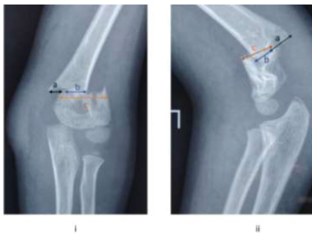
Fig. 2 (i, ii). Depiction of translation and osseous apposition in the coronal (i) and sagittal planes (ii). Translation = a/c . Osseous apposition = b/c .

Data were analyzed using chi-squared tests or Fisher exact tests for categorical variables and the sample t-test for continuous variables. Odds ratios (ORs) were estimated and reported with associated 95% confidence intervals (CIs). ROC curves were exploited for comparison of the diagnostic performance of various radiographic parameters