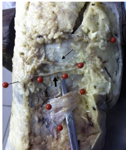
Fig. 2 – Photograph of a dissected right knee that shows the main IPBSN (wide arrow) and another proximal branch (narrow arrow).

Ebraheim and Mekhail 14 reported that injuries to this branch could be caused by the incision that is made to harvest the tendons. Figueroa et al. 5 believed that the injury occurred during the removal of the tendons, rather than during the skin incision. On the other hand, Kartus et al. 15 believed that this inadvertent injury could occur during the procedures of skin incision, initial exposure of the tendons or drilling the tibial tunnel.