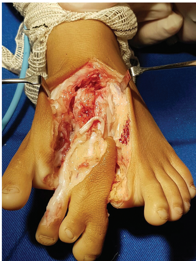
Fig. 3 Wedge resection of supernumerary rays and bones.

in the center of the foot, removing excessive skin, three central rays, and extra tendons and digital nerves, consistent with the case herein reported.