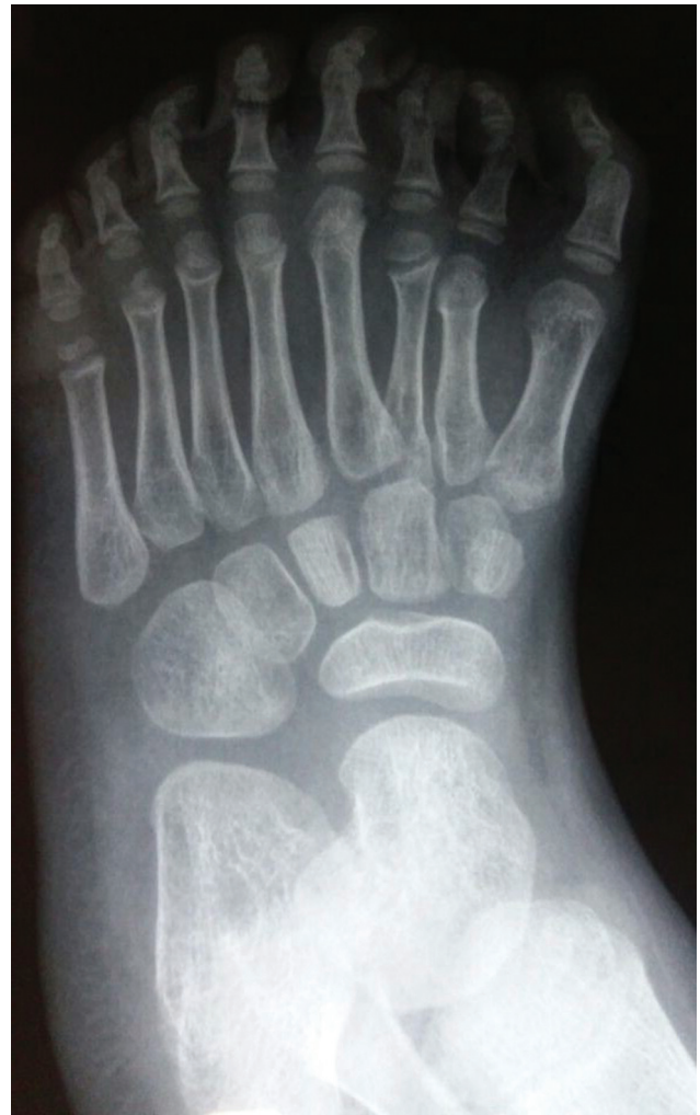
Fig. 2 Preoperative radiological appearance of the mirror foot.

Intraoperatively, cuneiform bone duplication is a challenge, as it requires deciding how many cuneiform bones to remove and the influence of the number of metatarsal bones.