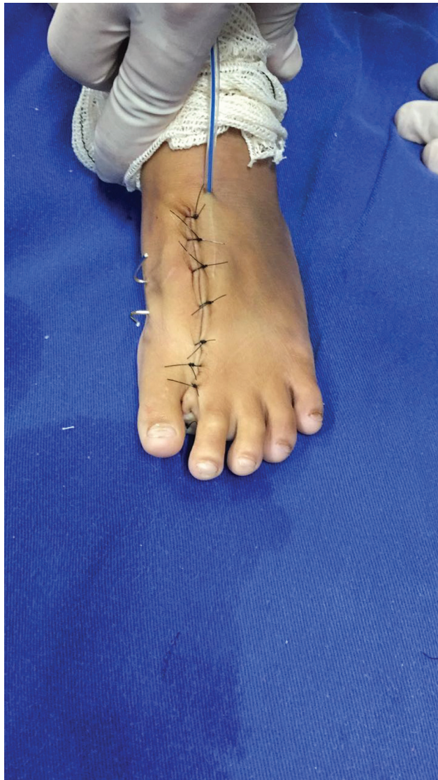
Fig. 5 Postoperative clinical appearance.

surgical treatment of these patients, promoting better quality of life and resulting in patient satisfaction. Standardizing the most appropriate type of treatment is challenging due to