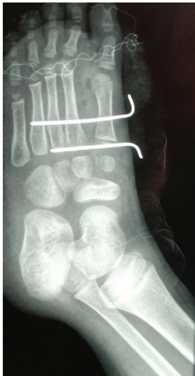
Fig. 4 Immediate postoperative radiological appearance.

All of these cases in the literature evolved with satisfactory functional and esthetic outcomes, which is consistent with the present study. Allen (1997, apud Osborn et al. 7 ) described another central ray resection technique associated