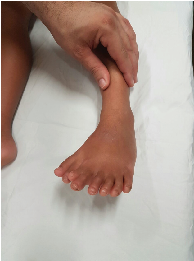
Fig. 1 Preoperative clinical appearance of the mirror foot.

with the nine corresponding phalanges, two cuneiform bones, and the corresponding tendons and digital nerves, preserving the fingers with an appearance closest to normal.