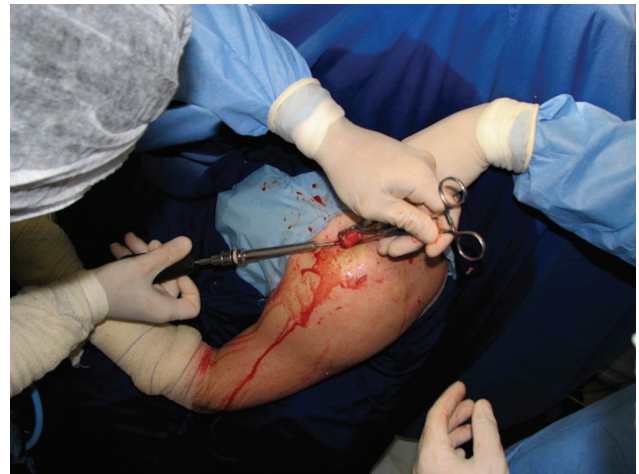
Fig. 4 Screw passing through the externalized coracoid process graft.