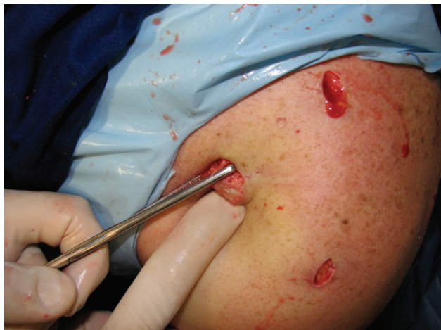
Fig. 3 Image of the left shoulder with the coracoid process externalized with the aid of a Kocher forceps.

Increasing screw torque does not necessarily mean that the graft is properly secured; to test screw tightness, a probe must be used to verify whether the washer is loose or secure.