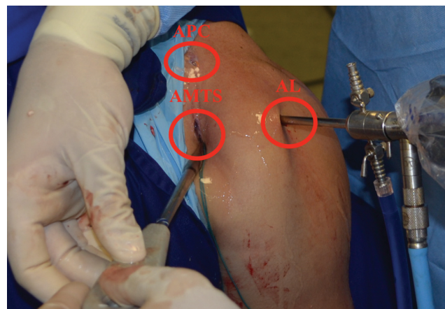
Fig. 1 Portals: APC, portal above the coracoid process; AMTS, anteromedial trans-subscapular portal; AL, anterolateral portal.

With the optics at the posterior portal, the subscapularis muscle tendon is open broadly following fiber direction with a strong Kelly forceps, electrocautery, and shaver through the anteromedial trans-scapular portal (►Fig. 2). The rotator interval and the origin of the coracoacromial ligament at the superolateral border of the coracoid process are removed with electrocautery and shaver. The glenoid cavity is enlarged by inserting the shaver through the anterolateral portal. Then, using the anteromedial trans-scapular portal, the drill passes through the open space in the subscapularis tendon and touches the border of the anteroinferior glenoid cavity. The optics is moved to the anterolateral portal for better viewing, and a hole is made 5 to 6 mm medial to the anterior edge of the glenoid cavity. 15 The size of this hole is measured. The optics is removed from the intra-articular space and placed at the anterior subdeltoid; then, the pectoralis minor tendon is released by electrocauterization through the portal located above the coracoid process, and the osteotomy of the coracoid process is performed with a microsaw and osteotomes. The use of the Kocher forceps previously inserted into the conjoined