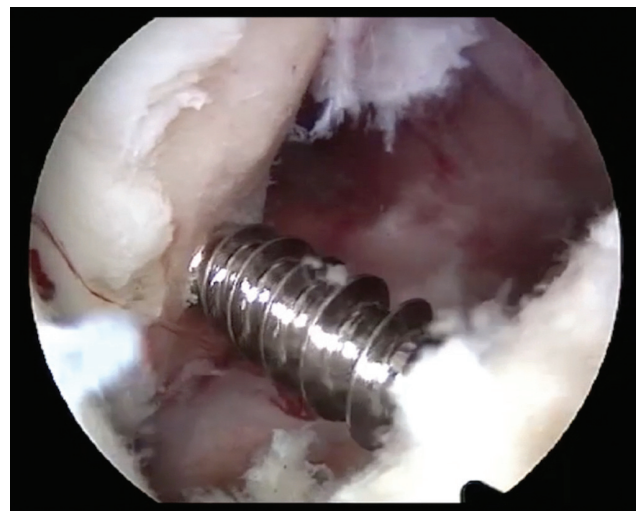
Fig. 5 Arthroscopic image of the shoulder showing the fixation in the anterior glenoid cavity; the arthroscope is in the anterolateral portal.