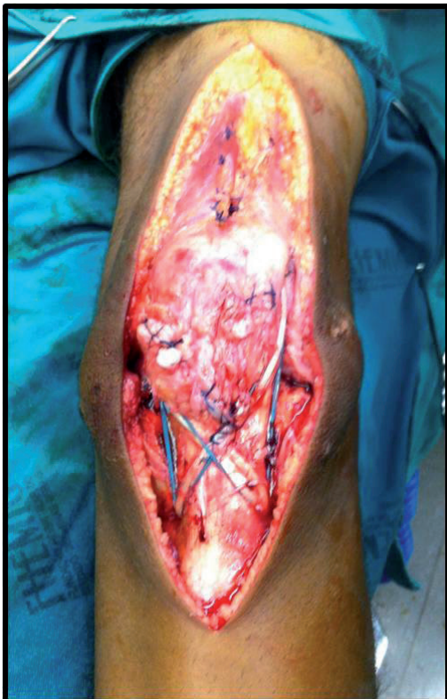
Fig. 5 - Final aspect of reconstruction.