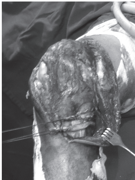
Fig. 1 - Ample anterior incision showing the semitendinosus and gracilis tendons repaired.

Patients begin to do isometric exercises on the second day after surgery and start to use crutches. Flexion begins at the end of the first week through exercises with the heel on the floor. Extension exercises begin on the 4th or 5th week and continue during the specialized rehabilitation. Immobilization is maintained for two to three weeks, and the splint is removed so that the patient can do the exercises.