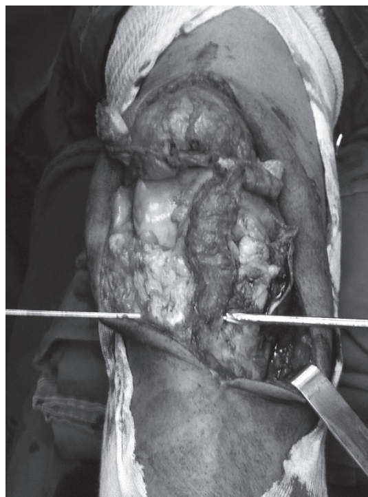
Fig. 3 - (A) Producing the patellar bone tunnel. (B) Producing the tibial bone tunnel.