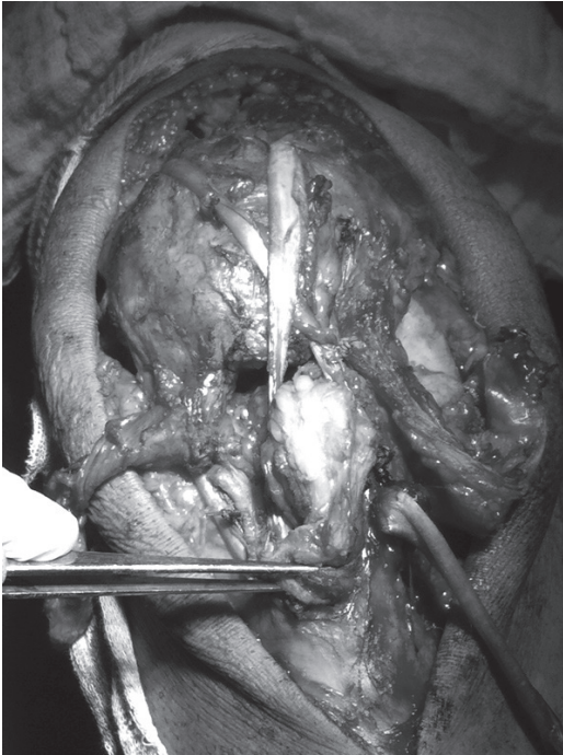
Fig. 4 - It should be noted that the tendon of the gracilis muscle is crossed to fill in the central region of the future patellar ligament.