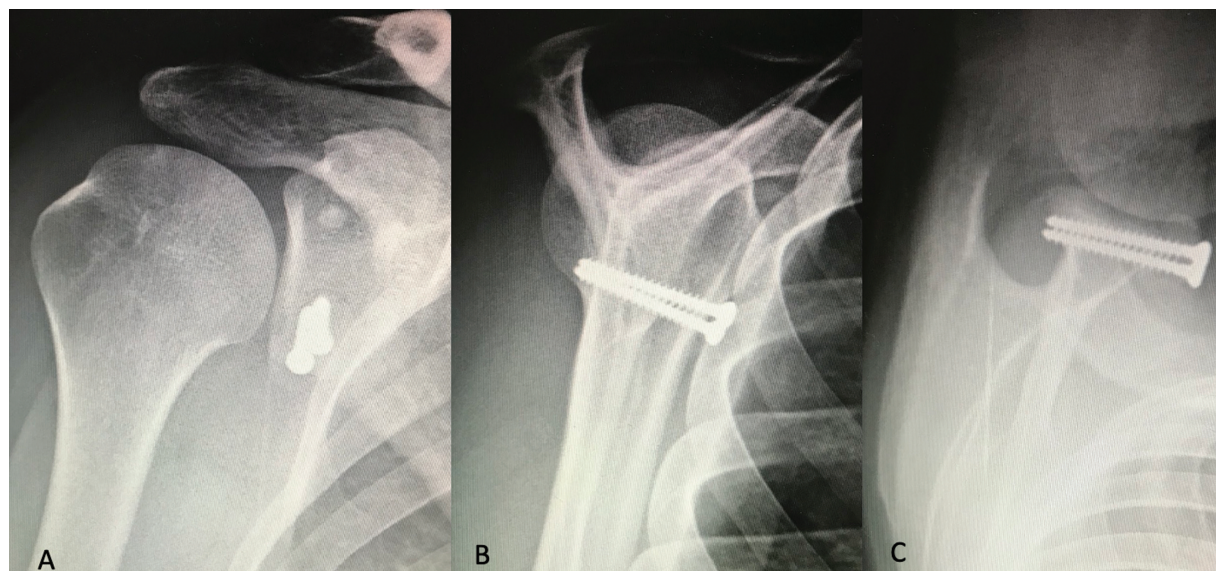
Fig. 2 Radiographs showing fixation with cancellous screws in the Latarjet procedure: (A) anteroposterior view; (B) profile view; (C) axillary view.