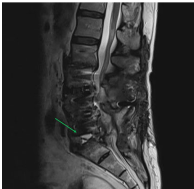
Fig. 3 Sagittal T2-weighted magnetic resonance image showing hyper-signal at the L5-S1 disc space referring to the local fluid collection.

(lumbosacral spine x-rays) showed signs of lumbosacral arthrodesis consolidation (→ Figure 4 ).