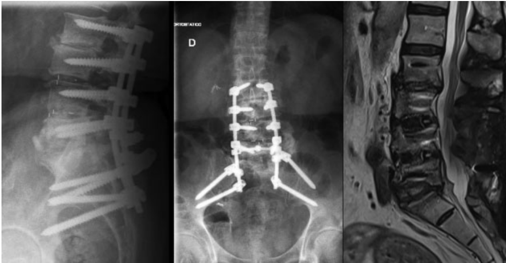
Fig. 4 Lateral (left) and front (center) spine radiographs showing signs of arthrodesis (L2-S1 fusion) and sagittal T2-weighted magnetic resonance image (right) showing signs of infection resolution.