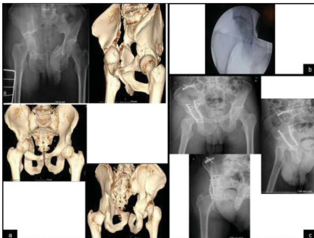
Fig. 2 Images of anteroposterior radiography of the pelvis and 3D ACT images for better characterization of the fracture of two columns of the right acetabulum with high extension to the iliac (a) Intraoperative image after maneuvers to reduce central dislocation (b) Radiological control in the anteroposterior view of the right pelvis, obturator oblique and oblique acetabular view of the right pelvis in the postoperative period, with acceptable reduction and absence of intra-articular screws.