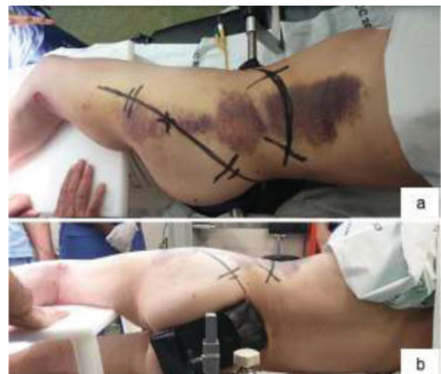
Fig. 4 Positioning of the patient in lateral decubitus and prior marking of the incisions (a) Posterior view of the positioning, and the image intensifier enters in this plane (b).

suggested reduction and fixation sequence. In the opinion of the authors, the main advantages of this option are: extrapelvic surgery, performed in a single surgical time