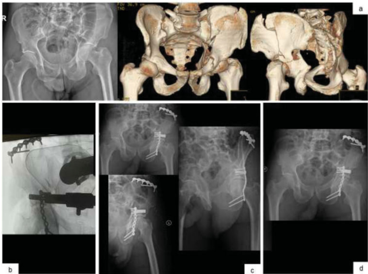
Fig. 3 Images of anteroposterior radiography of the pelvis and 3D ACT images for better characterization of the fracture of two columns of the left acetabulum with high extension to the iliac (a) Intraoperative control image (b) Radiological control in the anteroposterior view of the pelvis, obturator oblique and oblique acetabular view of the left pelvis in the immediate postoperative period (c) Anteroposterior radiograph of the pelvis at the 3rd month (d).

with the iliac crest approach. With 7 months of evolution, the patient presents autonomous gait and is without pain, with a Harris Hip Score of 91 points (►Fig. 3).