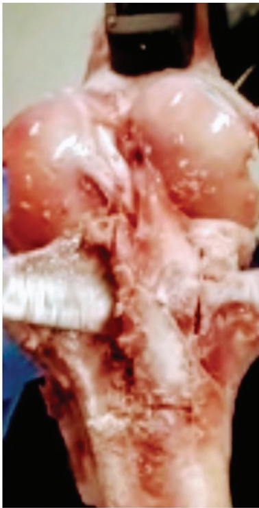
Fig. 1 Posterior vision of the knee with osteotomy of the tibial insertion.

et al., 7 who removed the ligaments without the bone fragments.