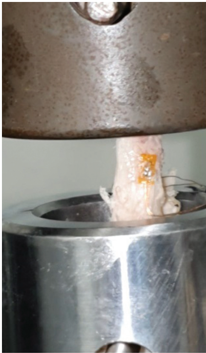
Fig. 4 Ligament coupled with strain gauge on the Instron.