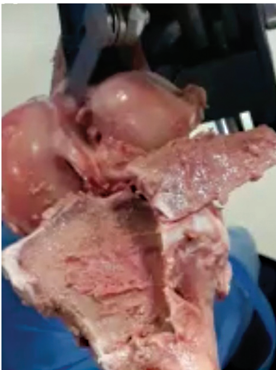
Fig. 3 Osteotomy of the femur between the cruciate ligaments.

The proposed protocol, known as Hill-Valley-Hill, served to simulate behavior in an in vivo situation. It is characterized by performing deformations within the expected physiological limit for adequate joint mobility, ranging between 3% (lower limit) and 6% (upper limit) over a period of 100 seconds and done in three stages: one performed as a relaxation test (6%), followed by recovery (3%) and by another relaxation test (6%). 6 Then, data from the behavioral results over time were extracted, with the objective of characterizing the viscoelastic behavior of the ligaments.