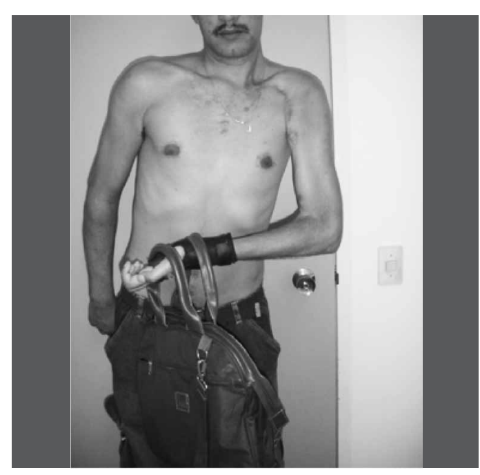
Figure 3 - Functional result in one patient.

For the statistical analysis, the patients with an active response (M4 or more) were considered to present a good response (Figure 3). Criteria similar to those used by the Mayo Clinic were used, as described by Carlsen et al <sup>(11)</sup>. The patients without an active response (M3 or less) were considered to present a poor response. We applied Fisher's exact test and took differences greater than 5% to be significant (p = or greater than 0.05).