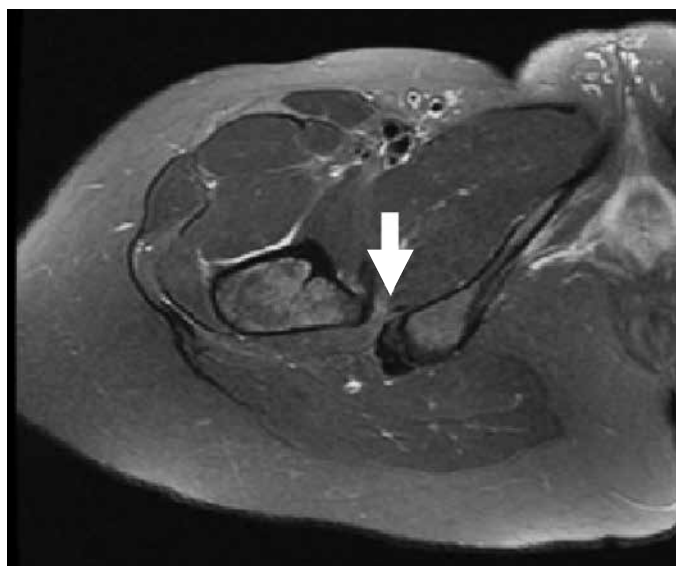
Figure 2 – Female patient, 31 years – Axial T2 MRI demonstrating ischiofemoral space narrowing and hypersignal on the quadratus femoris muscle.