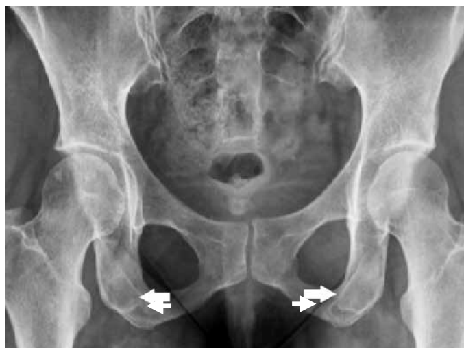
Figure 1 – AP radiograph of the pelvis showing valgus femoral neck, ischial cysts (arrows) and a close relationship between the lesser trochanter and ischium.

Additional tests included radiographic examinations of the pelvis and right hip demonstrating a valgus femoral neck, bilateral ischiofemoral space narrowing, and the presence of cysts in the right ischium (Figure 1). Faced with clinical and radiographic findings and diagnostic uncertainty, we requested a pelvic MRI, which showed increased signal in the quadratus femoris muscle on T2-weighted sequences (Figure 2). Once the diagnosis of ischiofemoral impingement was made, non-surgical treatment was introduced, based on a non-hormonal anti-inflammatory drug for seven days and daily physical therapy for stretching and strengthening the pelvic muscles, with progressive improvement of symptoms. After three months of treatment, the patient showed significant functional improvement, and resumed Pilates activities without any restriction.