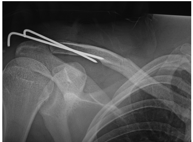
Fig. 2 - Reduction of the acromioclavicular dislocation and