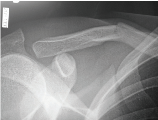
Fig. 1A - Incomplete diaphyseal fracture of the right clavicle and inferior acromioclavicular dislocation.

Surgical treatment was chosen, and surgical reduction was performed on the acromioclavicular dislocation and on the clavicular fracture, with a manual maneuver. Since the diaphyseal fracture was of greenstick type, the reduction was easy and stable. The coracoclavicular ligaments were complete, while the acromioclavicular ligament was injured. The acromioclavicular ligament was sutured and this joint was then fixed using two Steinmann wires (Fig. 2). These wires were subsequently removed, seven weeks later, and the patient was referred for physiotherapy. The digital radiological examination facilitated the evaluation of the two pathological conditions, and there was no need for a different examination for each condition. 5 An excellent clinical and radiographic result was presented after 12 months (Fig. 3).