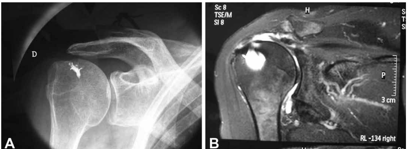
Figure 1 – Example of radiograph (A) and magnetic resonance image (B) of the right shoulder, showing tear in the tendon of the spinal supraspinatus muscle.

The mean time taken for the symptoms to restart was 21 months, with a range from zero to 228 months. Five patients who had undergone their first operation at