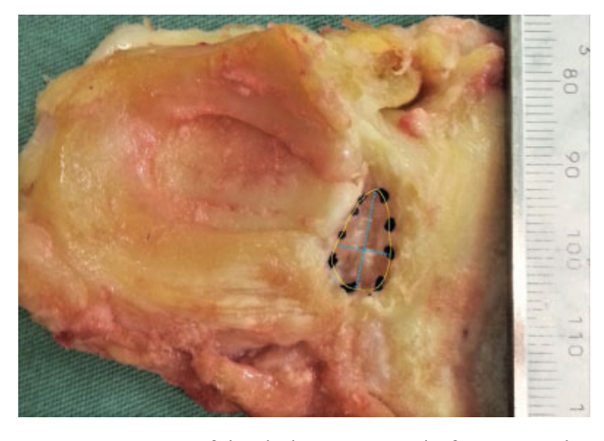
Fig. 1 Superior view of the tibial superior articular face, removed at arthroplasty, with the delimitation of the ACL fovea and the definition of its length and width.

(42.4%). Eighteen knees were right (54.5%) and 15 were left (45.5%). The average age of the subjects was 69.5 years old ( \pm 7.3), the median weight was 78.4 kg ( \pm 12.3) and the average height was 1.58 m ( \pm 0.08).