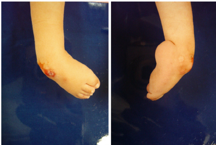
Fig. 2 – Patient with the ability to walk within the community, with myelodysplastic clubfoot with a lesion in the dorsolateral skin (the weight-bearing area of this foot).

of the midfoot and forefoot. Therefore, it does not provide full correction of the deformities and increases the possibility of recurrence.