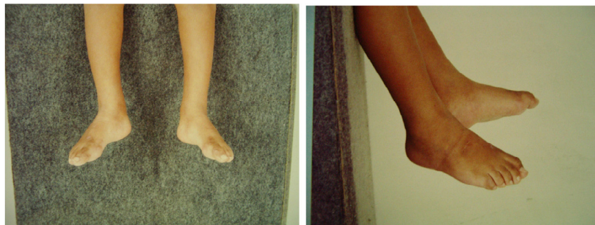
Fig. 3 – Same patient as in Fig. 1, after the operation on the stiff clubfoot consisting of PMLR + talectomy.