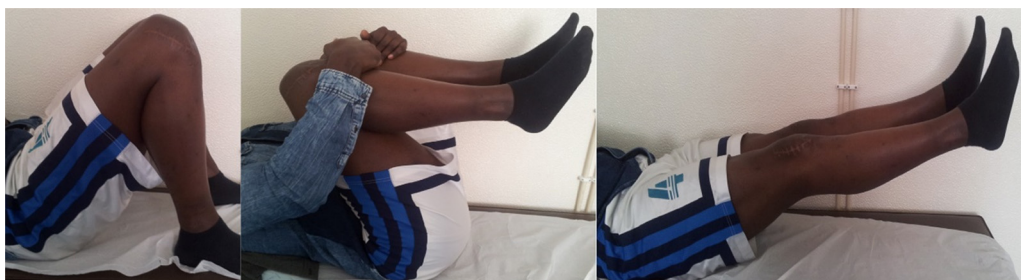
Fig. 6 – Five months after surgery: 135° flexion, 0° extension at both knees.