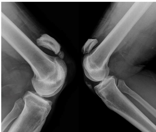
Fig. 1 – Lateral projection knee radiographs after bilateral patellar tendon rupture, showing cephalic patellar migration (“patella alta”), avulsion fractures of inferior poles of both patellae and an isolated undisplaced spiral fracture of the left fibular neck (left side).

The X-rays showed cephalic patellar migration and small calcification avulsions of the inferior poles of both patellae. An isolated undisplaced spiral fracture of the left fibular