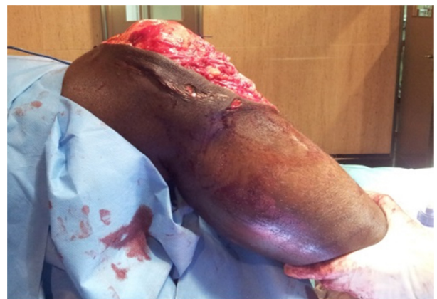
Fig. 3 – Flexion knee movement testing the sewing integrity and resistance.

neck was also identified (Fig. 1). Ultrasound confirmed total bilateral rupture of the patellar tendons. Intraoperatively we found both tendons torn in their substance near the inferior patellar poles, with some segments avulsed from the patellar insertion. Lateral and medial retinacula were disrupted bilaterally. An end-to-end primary Kessler-type tendon repair reinforced with intraosseous sutures was performed in both knees. We temporarily protected it with cerclage wiring, followed by immobilization with a leg cylinder cast. We chose a nonabsorbable monofilament loop suture that allowed a proper tendon suture tension, by its second passage through the middle of the loop (Fig. 2). The tension within stitches was carefully adjusted to avoid shortening of infrapatellar length, according to the patellae position. The ruptured retinacula were repaired with Vicryl sutures. The strength of the repair was tested by careful flexion of both knees (Fig. 3). Cerclage wiring was applied in a figure-of-eight tension band running around the superior pole of the patellae, passing in front of the tendon, fixed with a transverse screw through the tibia tubercle and tied at average 60° of knee flexion (Fig. 4).