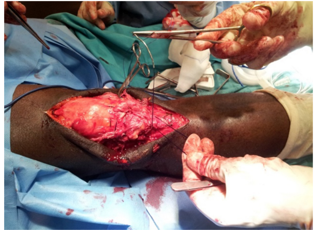
Fig. 2 – Bilateral patella tendon rupture at surgery: monofilament loop suture that allowed, by its passage in the middle of the loop, a proper tendon suture tension.

neck was also identified (Fig. 1). Ultrasound confirmed total bilateral rupture of the patellar tendons. Intraoperatively we found both tendons torn in their substance near the inferior patellar poles, with some segments avulsed from the patellar insertion. Lateral and medial retinacula were disrupted bilaterally. An end-to-end primary Kessler-type tendon repair reinforced with intraosseous sutures was performed in both knees. We temporarily protected it with cerclage wiring, followed by immobilization with a leg cylinder cast. We chose a nonabsorbable monofilament loop suture that allowed a proper tendon suture tension, by its second passage through the middle of the loop (Fig. 2). The tension within stitches was carefully adjusted to avoid shortening of infrapatellar length, according to the patellae position. The ruptured retinacula were repaired with Vicryl sutures. The strength of the repair was tested by careful flexion of both knees (Fig. 3). Cerclage wiring was applied in a figure-of-eight tension band running around the superior pole of the patellae, passing in front of the tendon, fixed with a transverse screw through the tibia tubercle and tied at average 60° of knee flexion (Fig. 4).