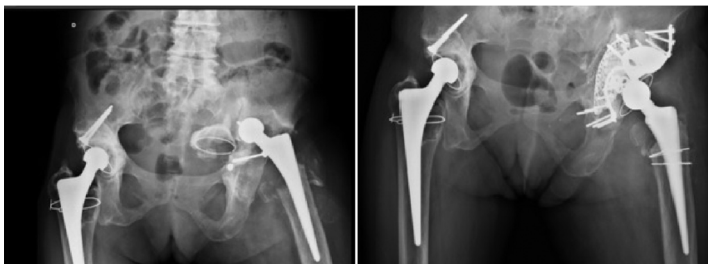
Fig. 2 – Pre- and postoperative radiography of an arthroplasty reconstruction in a patient with acetabular defect classified as d’Antonio type III. Reconstruction plate, tantalum wedge, lyophilized bovine bone graft, and acetabular floor mesh were used.

to d’Antonio apud van Haaren et al., 10 based on radiographic images; patients were reclassified intraoperatively when necessary.