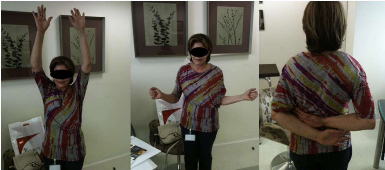
Fig. 2 – Elevation and external and internal rotation in a patient, 12 months after the operation.

There were 15 cases of complications, 14 of notching and one of dislocation of the components during the immediate postoperative period, in which revision with exchange of the polyethylene piece was necessary. Up to the time of the most recent follow-up, only this patient has undergone revision.