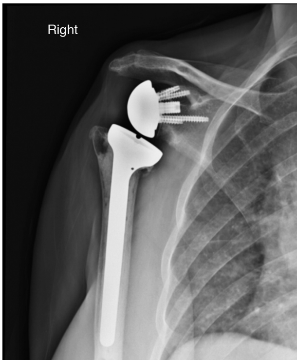
Fig. 3 – Notching: reabsorption of the lower portion of the scapular neck.

In relation to the presence of notching, 13 (48.1%) of the patients did not present this complication, while nine (33.3%) presented grade 1 according to Nerot and five (18.5%) presented grade 2 (Fig. 3).