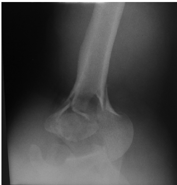
Fig. 3 – Radiograph of the left shoulder on lateral axillary view.

activities, joint mobility, and isometric muscle strength. To calculate the score, the protocol must be applied bilaterally. The maximum score is 100 points; the closer to 100, the better the functional capacity. 18