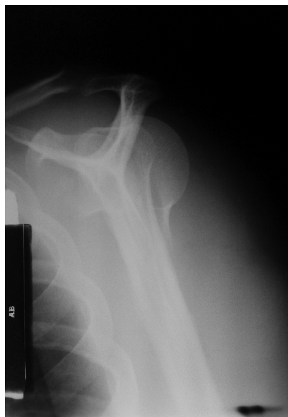
Fig. 2 – Radiograph of the left shoulder on a lateral view.

physical therapy and four, home exercises under medical supervision. One patient admitted to not adhering to the physical therapy or exercises with the prescribed frequency, giving preference to the treatment of associated injuries (Table 2).