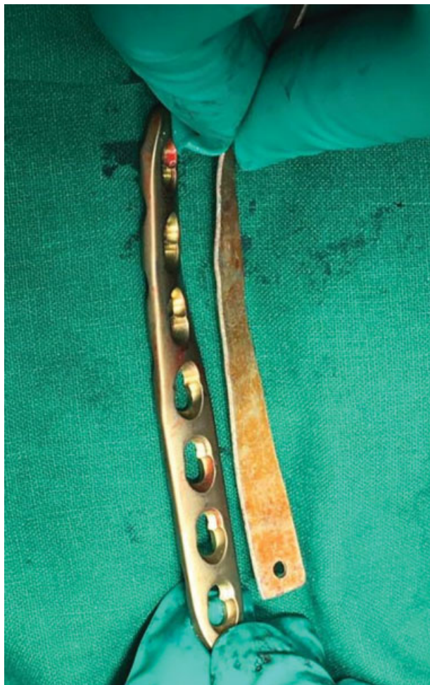
Fig. 4 Locking compression plate twisted to match the template.