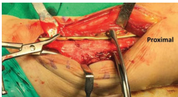
Fig. 5 Twisted locking compression plate applied after fracture reduction.