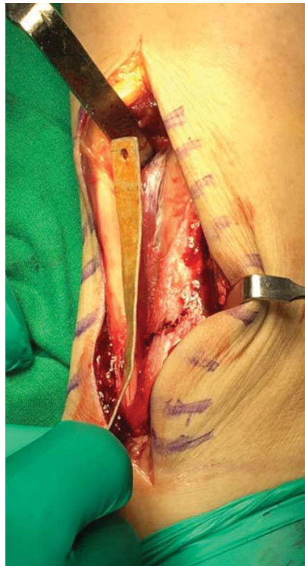
Fig. 3 Template contoured to match the distal fibula anatomy.

and the posterior surface of lateral malleolus distally with plate holding clamps, matching the distal fibular anatomy (► Fig. 5 ). The plate was used as a posterior buttress by first engaging the hole closest to the fracture site in the proximal fragment, abutting the plate to the lateral malleolus. The distal fragment was then fixed with bicortical screws in posterior to anterior direction; followed by bicortical lateral to medial screws in the proximal fragment. The syndesmosis was fixed with a tricortical 3.5mm screw through the plate where indicated. After fixation, we confirmed that the peroneal tendons and tendon sheaths were not in direct contact with the hardware. The fracture reduction, screw position and lengths were checked intraoperatively with an image intensifier. Medial fixation/repair and/or distal tibia plating were done where necessary. After layered wound closure and bandaging, all of the patients were given a posterior slab/sugar tong splint for 48 hours followed by an ankle brace for 4 to 6 weeks. Active ankle range of motion was encouraged after removal of the slab at 48 hours. Patients were mobilized nonweight bearing with a walker/crutches. Full body weight bearing was permitted according to the clinical and radiographic recovery.