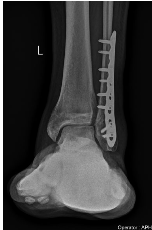
Fig. 8 34-month follow-up radiograph showing union.

turn are stronger than lateral nonlocking neutralization plates. 24-28 Locking plates are being increasingly used for periarticular and metaphyseal fracture fixation, including distal fibula fractures. 14,26 The posterolateral antiglide plate allowed for longer bicortical screws through the distal fragment, on account of its position, thereby improving fixation. 28