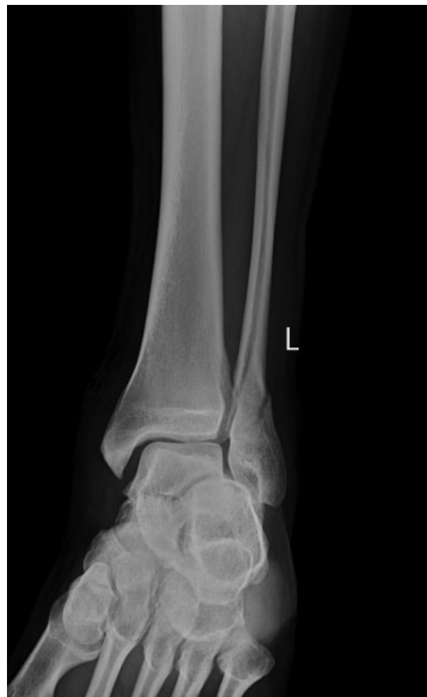
Fig. 6 Preoperative anteroposterior radiograph of a left ankle with Danis-Weber type B lateral malleolus fracture.

The medial malleolus was fixed with tension band wiring in 4 cases, and with cancellous screw fixation in 21 cases, while 2 were fixed with 3.5 mm medial distal tibia LCP. Posterior malleolus fixation was performed in two cases with cancellous screws. Deltoid ligament was reconstructed in two patients, while three of the four syndesmotic injuries were fixed with a syndesmotic screw.