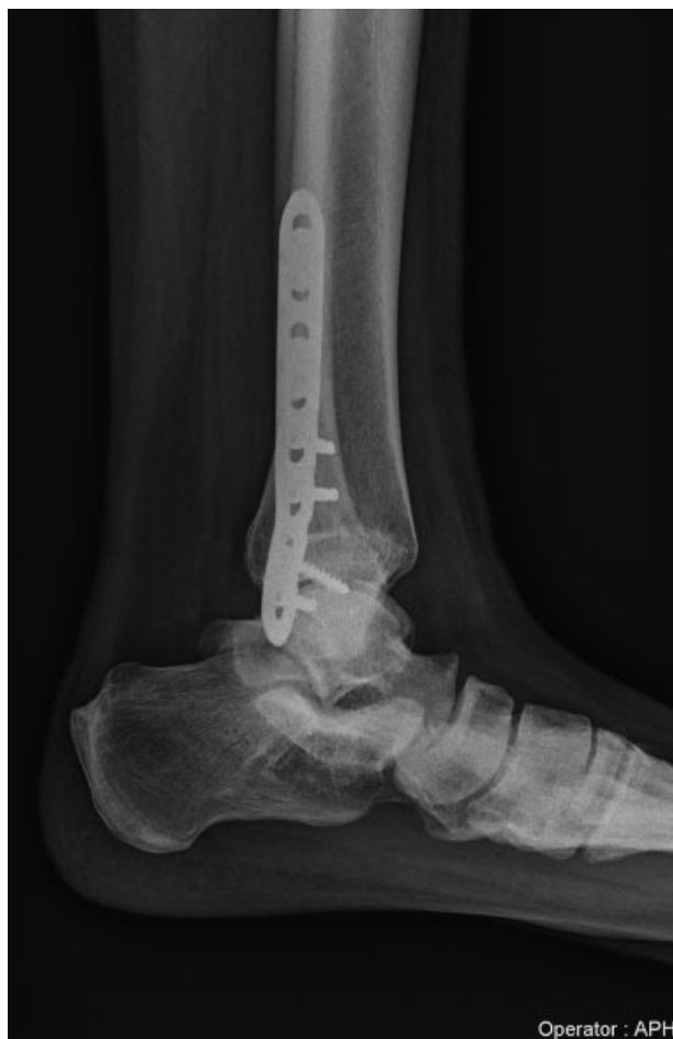
Fig. 9 34-month follow-up radiograph showing union.