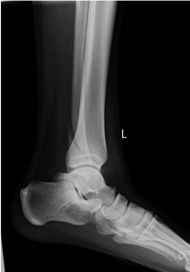
Fig. 7 Preoperative lateral radiograph of a left ankle with Danis-Weber type B lateral malleolus fracture.